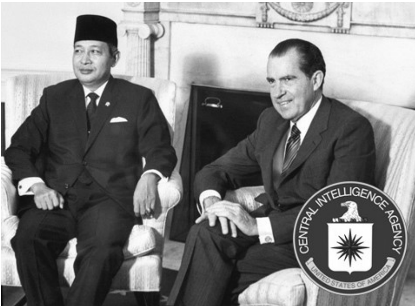
Indonesia's Suharto & US President Nixon, 1970

and PR, worked particularly hard to combat both covert and overt American interventions (as quite extensively documented in Nuclear Free , NZ Monthly Review , and the original historic series of PR).