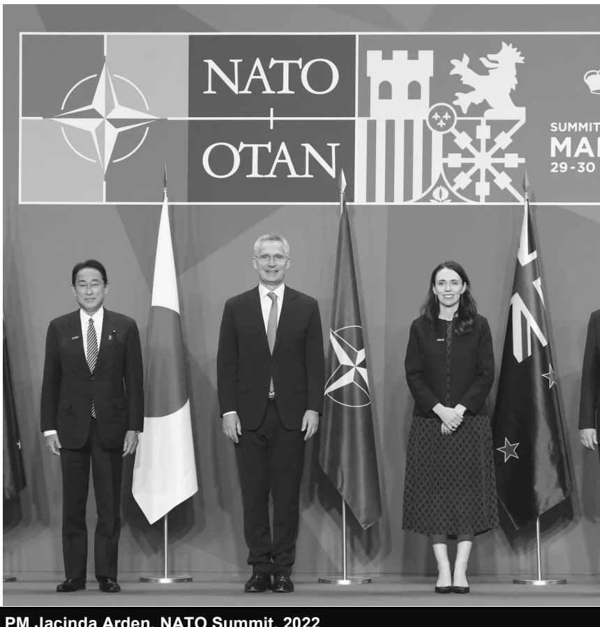
PM Jacinda Arden, NATO Summit, 2022

Indeed, PM Jacinda Ardern in her eagerness to demonstrate her subservience to the Western war machine has gone out of her way to show strong support for the Kyiv regime and opposition to Russia’s “aggression”. Newspaper headlines proclaim the story here like “PM’s Call Assures Ukraine Of NZ Support” ( SST , 20/3/22) and “Ardern Speaks With Zelensky After NATO Gathering” ( Press , 1/7/22). She reinforced her position on the Ukraine crisis/war when attending the 77 th UN General Assembly in New York in September 2022. Jacinda Ardern then, formerly celebrated internationally for her inspiring empathy and empathetic political style, has transformed herself into a militarist im-