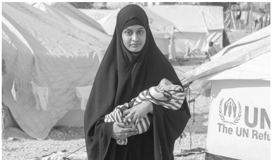
"ISIS Bride" Shamima Begum

The Director of Strategy Policy and Engagement at the agency told the Guardian (29/8/22) that: "We know that if we get the right mix of minds, it will give us a competitive advantage and that's why we talk labour diversity as being mission critical". Recent GCHQ research showed critical individuals pioneering artificial intelligence developments "are shaped by their own personal experiences and backgrounds".