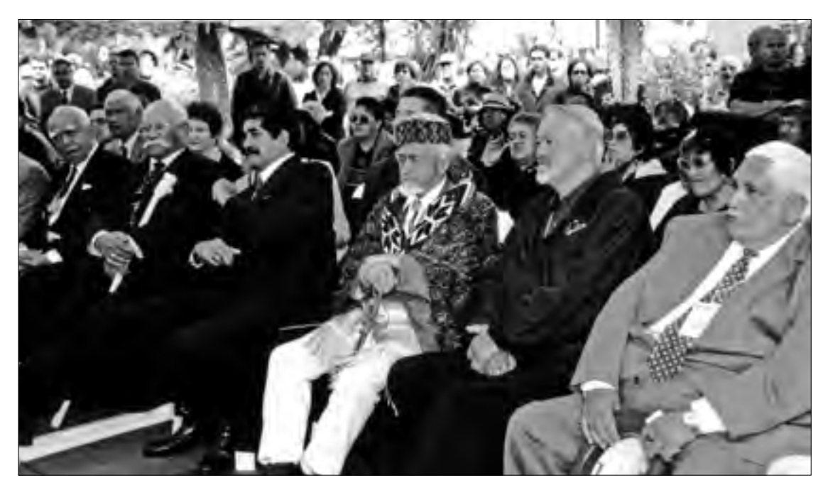
Kaumātua at the launch of Māori Television in March, 2004.

is not just a bill of rights for Māori ... we must remember that if we are the tangata whenua, the original people, then the Pākehā are tangata Tiriti, those who belong to the land by right of that Treaty." The Treaty is also a bill of rights for non-Māori.