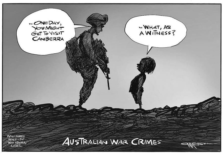
NZ Herald, 21/11/20

In terms of the Australian record, this country's military deployment in Afghanistan has been in line with historical trajectory, given the white settlers' genocidal treatment of the indigenous Aboriginal people ("Evidence Of 250 Massacres Of Indigenous Australians Mapped", Guardian , 26/7/18)<sup>33</sup>. There were probably in fact more than 500 massacres of Aborigines, with mass killings even occurring well into the middle of the 20<sup>th</sup> Century! (ibid.).