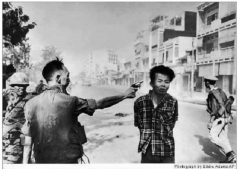
Execution of a Viet Cong Guerrilla 1968

The rise of China and Anglo-American/Western efforts to counter this rise have now come front stage. We can cite another leading American neo-imperialist ideologue in this regard. Robert Kaplan pontificated in 2005 that: "The Middle East is just a blip. The American military contest in the Pacific will define the 21<sup>st</sup> Century. And China will be a more formidable adversary than Russia ever was" ("How We Would Fight China", Atlantic , 1/6/05)<sup>23</sup>.