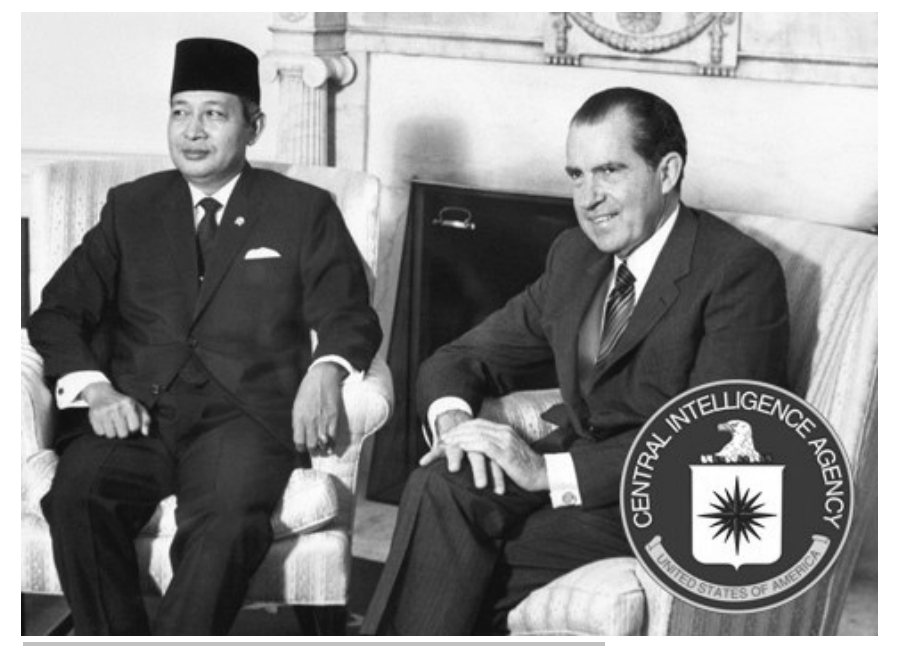
Indonesia's Suharto & US President Nixon, 1970

and PR , worked particularly hard to combat both covert and overt American interventions (as quite extensively documented in Nuclear Free , NZ Monthly Review , and the original historic series of PR ).