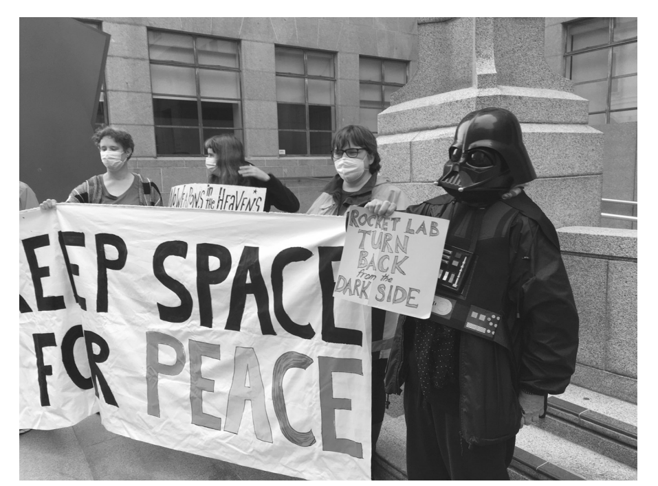
Wellington solidarity picket, 5/9/22.

As was to be expected, turnout was low, in the 20s. But that didn't stop it being a very worthwhile exercise. ABC's Warren Thomson had gone to a lot of trouble preparing material to be displayed and distributed at the meeting. I spoke first, to provide the context for why people are alarmed by, and opposed to, Rocket Lab's role as a contractor for the US military and spy agencies. You can read my speech at http:// www.converge.org.nz/abc/pdf/ KeepSpaceForPeaceTalk.pdf My speech included showing a very short YouTube clip explaining the 1967 Outer Space Treaty and you view that https:// www.youtube.com/watch? v=mqVtkAFBpgY.