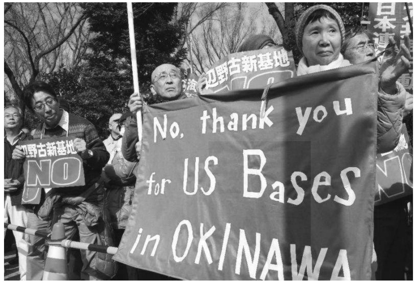
Okinawa anti-bases protest, 2018

Ports in Papua New Guinea are already being developed by China, so the country is playing off both superpowers. The Asia Pacific Economic Cooperation (APEC) meeting was held there in November 2018, with the Chinese President in attend-