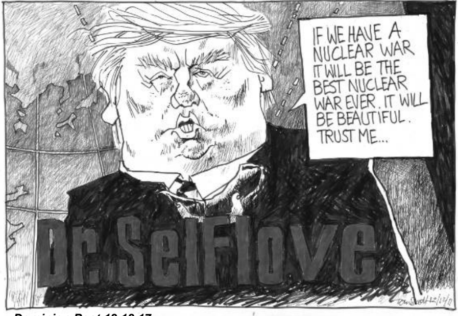
Dominion Post 12.12.17

succeeded in uniting China and Russia in a de facto front against the West. This was recently signalled by the "biggest war games" held in Russia's history ("Kremlin Begins Biggest War Games With China", Press, 13/9/18). Russia combined with "more than 3,000 Chinese soldiers in a show of military might intended to counter what it called the 'aggressive and unfriendly' attitudes towards it" (ibid.). The Vostok war games may well mark a major geopolitical downturn. Let's hope not, and do our best for peace-making!