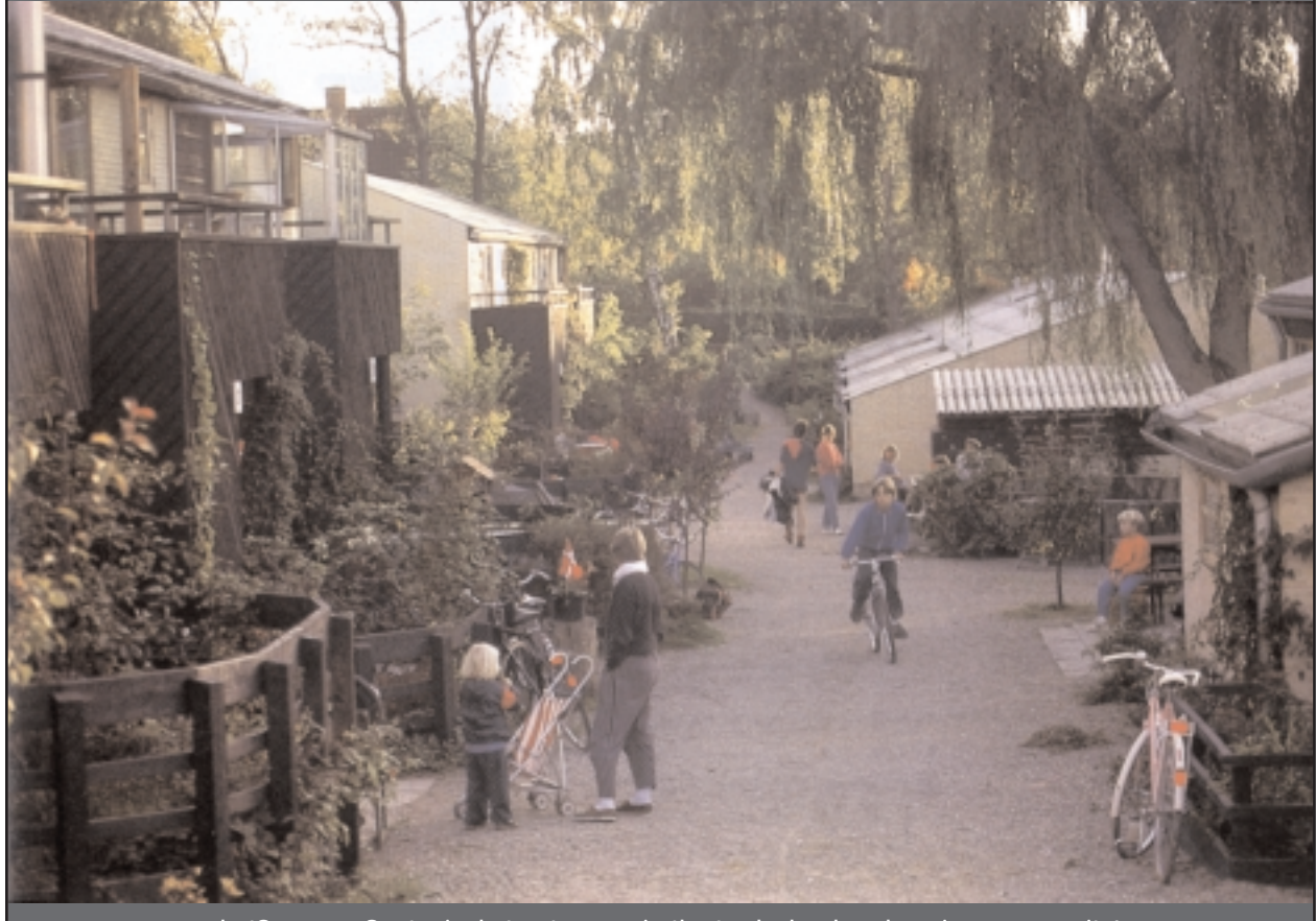
what? no cars? a typical street scene in the trudeslund co-housing community<sup>3</sup>