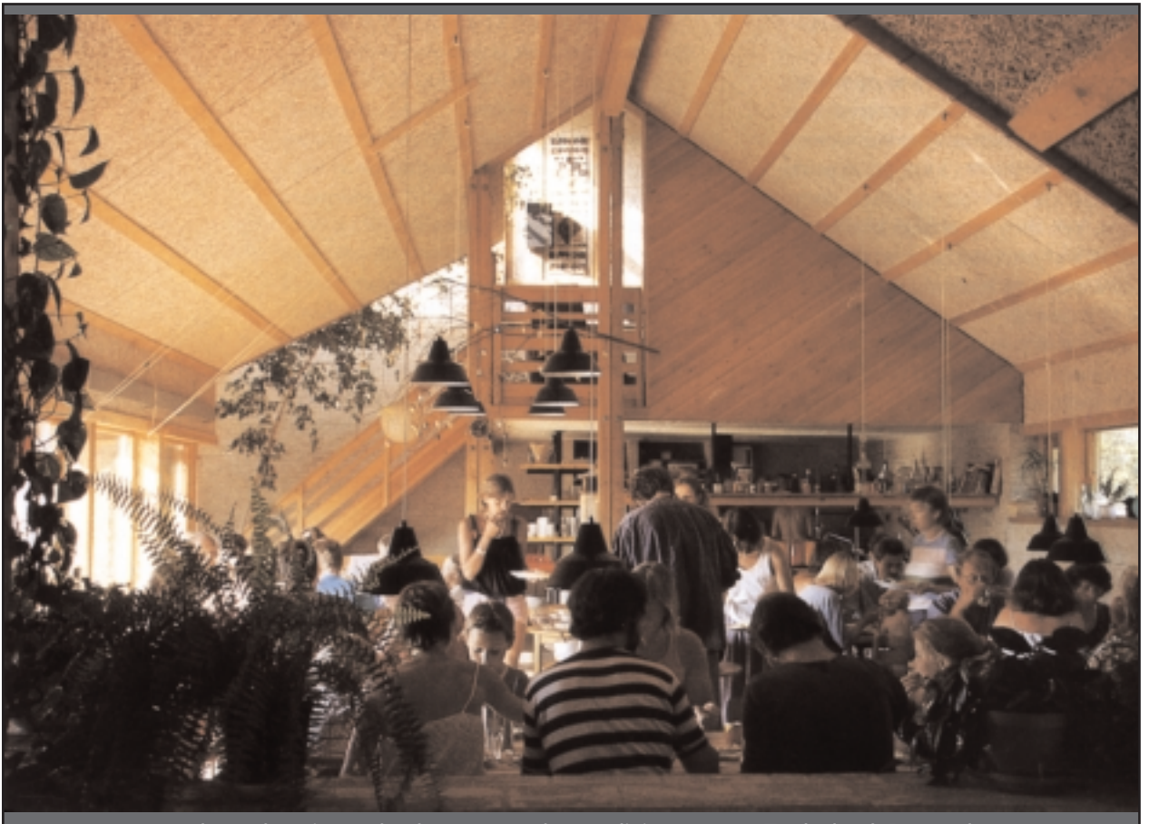
meals, co-housing style: the common house dining room at Trudeslund, Denmark<sup>3</sup>