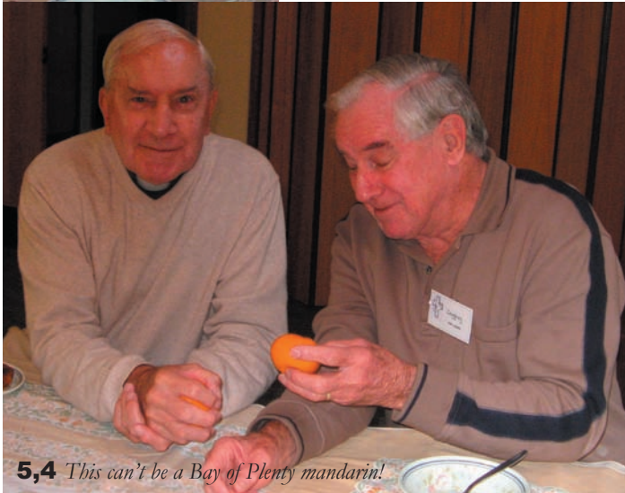
5,4 This can't be a Bay of Plenty mandarin!