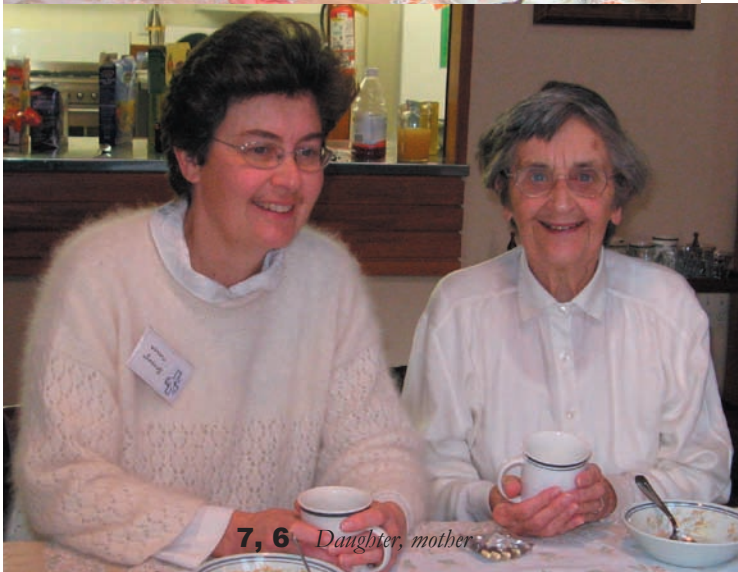
7, 6 Daughter, mother